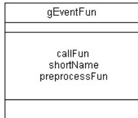
Figure 6: The gEventFun Class.

The gEventFun class stores all of the information about a potential callback function. Having the callback function information stored in an object allows a user to connect events to callback functions. The class definition for gEventFun is shown in Figure 6.