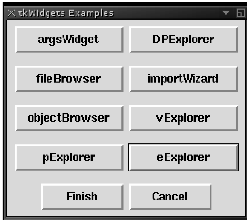
Figure 1: A snapshot of the widget when the example code chunk is executed